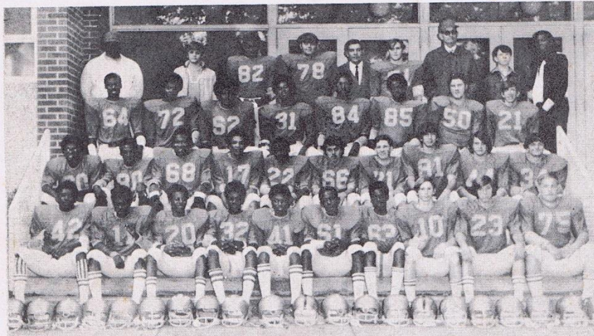
Congratulations to the Tech Football Team and Coaches for playing a fine season of football from the paper staff.